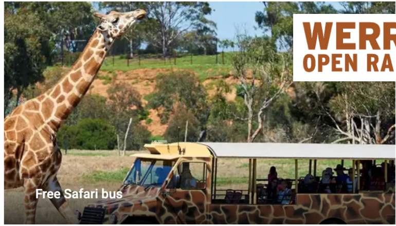
Free Safari bus