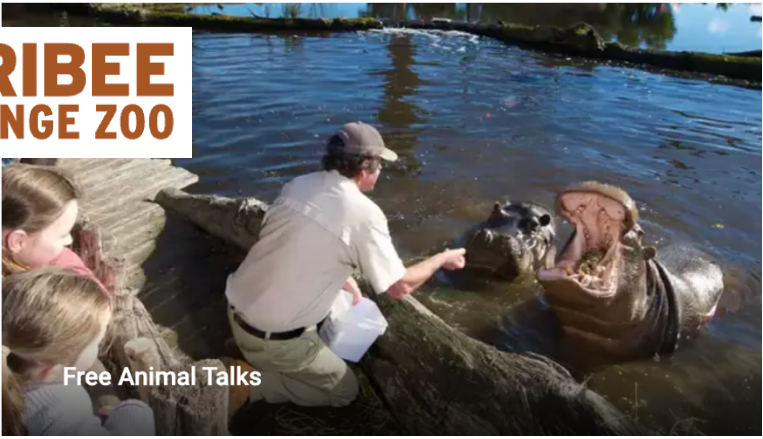
Free Animal Talks